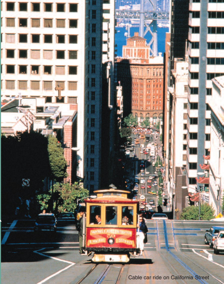
Cable car ride on California Street

Marines' Memorial Club and Hotel San Francisco, California